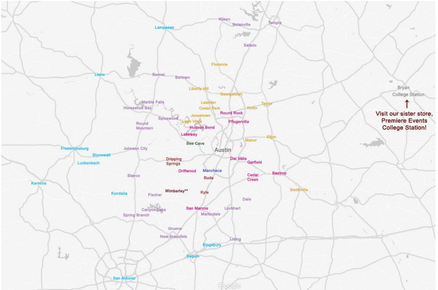
PREMIERE EVENTS DELIVERY FEE ZONE MAP (BY CITY)